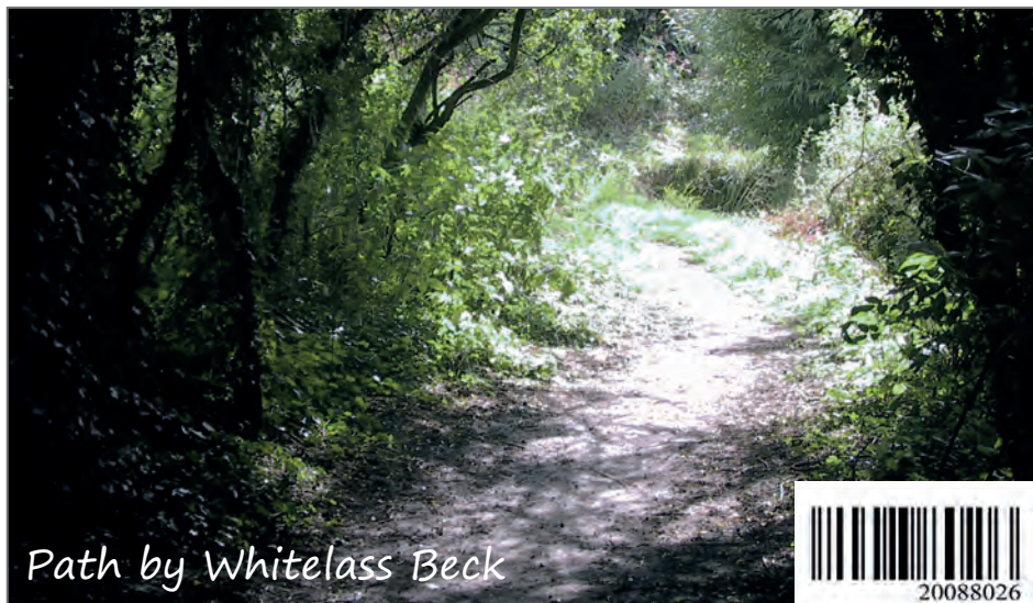
Path by Whitelass Beck

Go diagonally left towards another kissing gate about 200 metres away close to the Cod Beck again. Go up